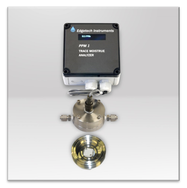
The PPM1 Trace Moisture Analyzer