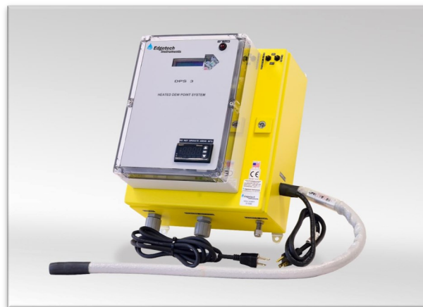
The Edgetech Instruments DPS3