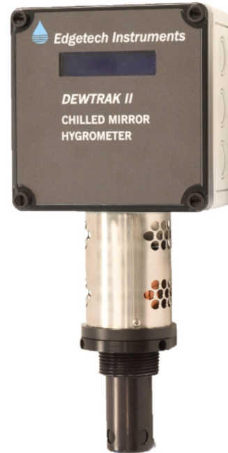
DewTrak II Hygrometer With the DX Sensor