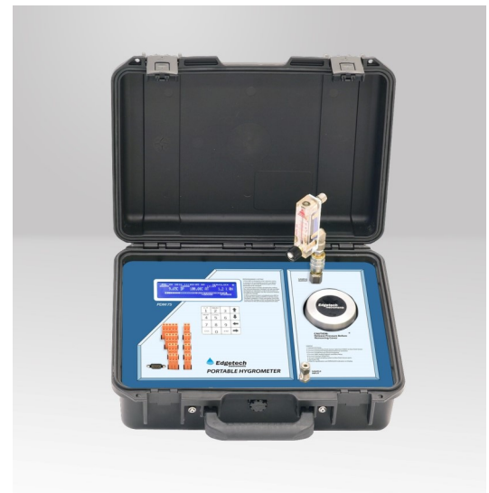
PDM75-X3SF with X3SF Sensor

Model Description Max. Range, D/F Point at 25°C Ambient X3 Passive Panel Mount, heat sink though panel -40°C to 75°C X3F Active, Standard Fan Cooled -60°C to 75°C X3SF Active, High Efficiency Super Fan Cooled -65°C to 75°C X3LC Active, Water Cooled at 0°C -80°C to 75°C X3LC Active, Chilled Water Cooling -85°C to 75°C