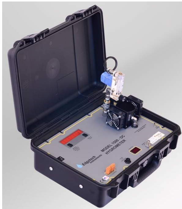
The Edgetech Instruments Model 1500