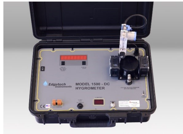
The Edgetech Instruments Model 1500