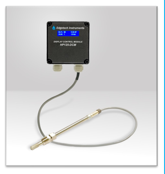
The HP125 Series Smart Probe with Optional Display Module