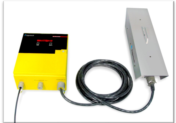
The Edgetech Instruments 200M

All Edgetech Instruments dew/frost point hygrometers are manufactured and supported in the USA in a modern, ISO 9001:2015 registered facility with ISO/IEC 17025:2017 accredited calibration laboratory. The 200M is delivered with a NIST traceability certificate.