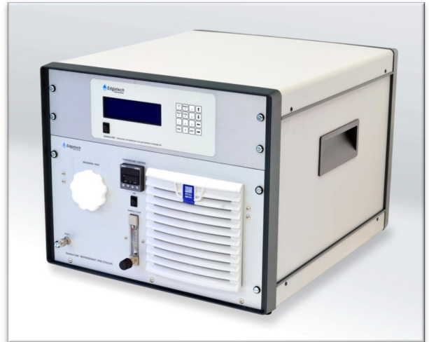
The Edgetech Instruments DewTech 390