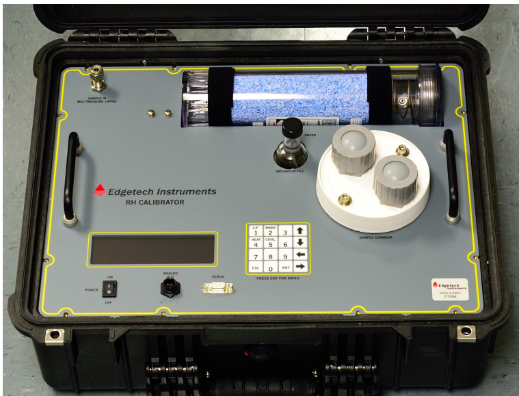
Figure 4a: A portable humidity calibrator traceable to NIST used to calibrate several humidity transmitter probes at once; this highly accurate, \pm 0.5\%RH , \pm 0.2^\circ C air temp, precision instrument can be used in the field or in the lab.

Because CMH is a fundamental method of measurement, it can be made traceable to national standards. When CMH systems are married to precision humidity generators, they constitute a calibration system in which secondary humidity measuring devices e.g.