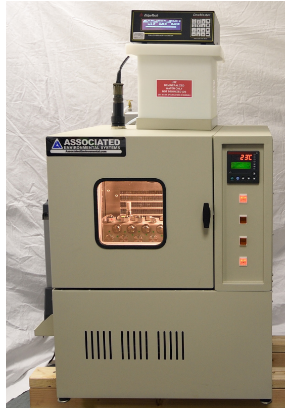
Figure 4b: A high capacity precision humidity and temperature environmental chamber, ELH Environmental Chamber, fitted with a traceable Dew Master and chilled mirror hygrometer; accuracy of the CMH is \pm 0.2^\circ C or better, and precision at 50%RH is 0.5^\circ C , nominal.

of hydrofluoric and sulfurous acids, which cause dielectric breakdown and corrosion of metal components.