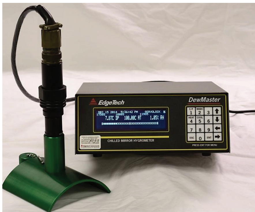
Figure 2. An example of a chilled mirror hygrometer configured in an insertion probe for O-ring sealed duct mounting; the unit, the model D Series Probe with a Dew Master control unit, provides several output signals e.g. RS232, 4-20 ma, 0 to 10 Volt, offers unit inter-conversions like ppmv, dew/frost point, gr/lb, etc., and comes equipped with alarm settings.