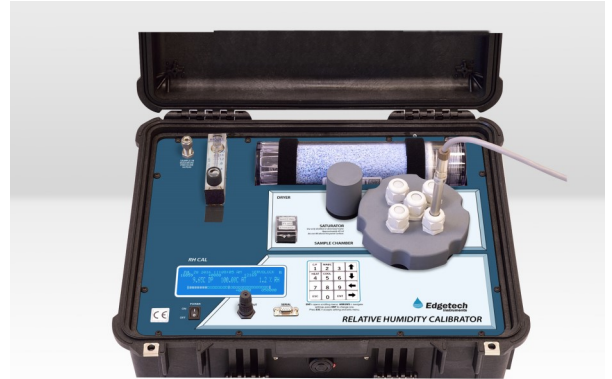
The Edgetech Instruments RH CAL Portable Relative Humidity Calibrator

All Edgetech Instruments calibration products and systems are manufactured and supported in the USA in a modern, ISO 9001:2008 registered facility with ISO/IEC 17025:2005 accredited calibration laboratory. The RH Cal is delivered with a multi-point NIST traceable ISO/IEC 17025:2005 accredited calibration certificate as standard.