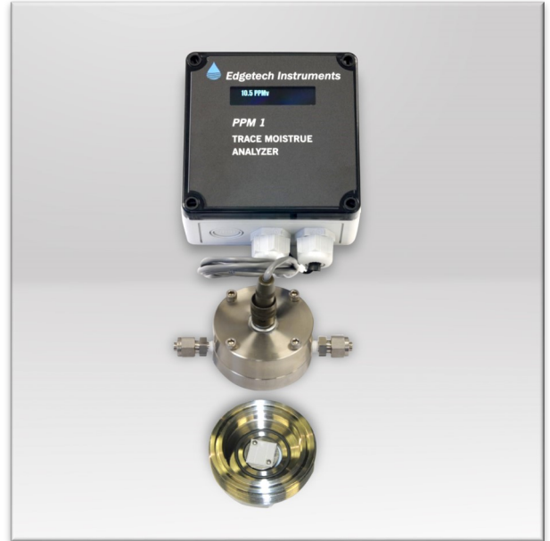
The PPM1 Trace Moisture Analyzer

All Edgetech Instruments hygrometers are manufactured and supported in the USA in a modern, ISO 9001:2008 registered, ISO/IEC 17025:2005 accredited facility. All calibrations and certifications are traceable to NIST.